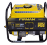
#10531 Firman 1500 Watt Gas Generator