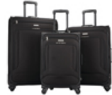
#80450 American Tourister 3 Piece Spinner Luggage Set