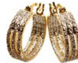
#60282 1/2 CTTW Diamond 18K Sterling Silver Earrings