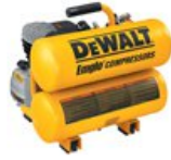
#10511 DeWalt 1.1HP 4 Gallon Electric Air Compressor