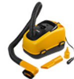
#40413 Wagan Wet/Dry Autovac with Air Inflator