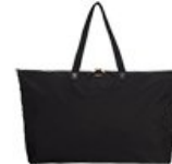
#60314 Tumi Just in Case Shopper