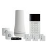
#10510 SimpliSafe Home Security System