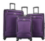
#80451 American Tourister 3 Piece Spinner Luggage Set